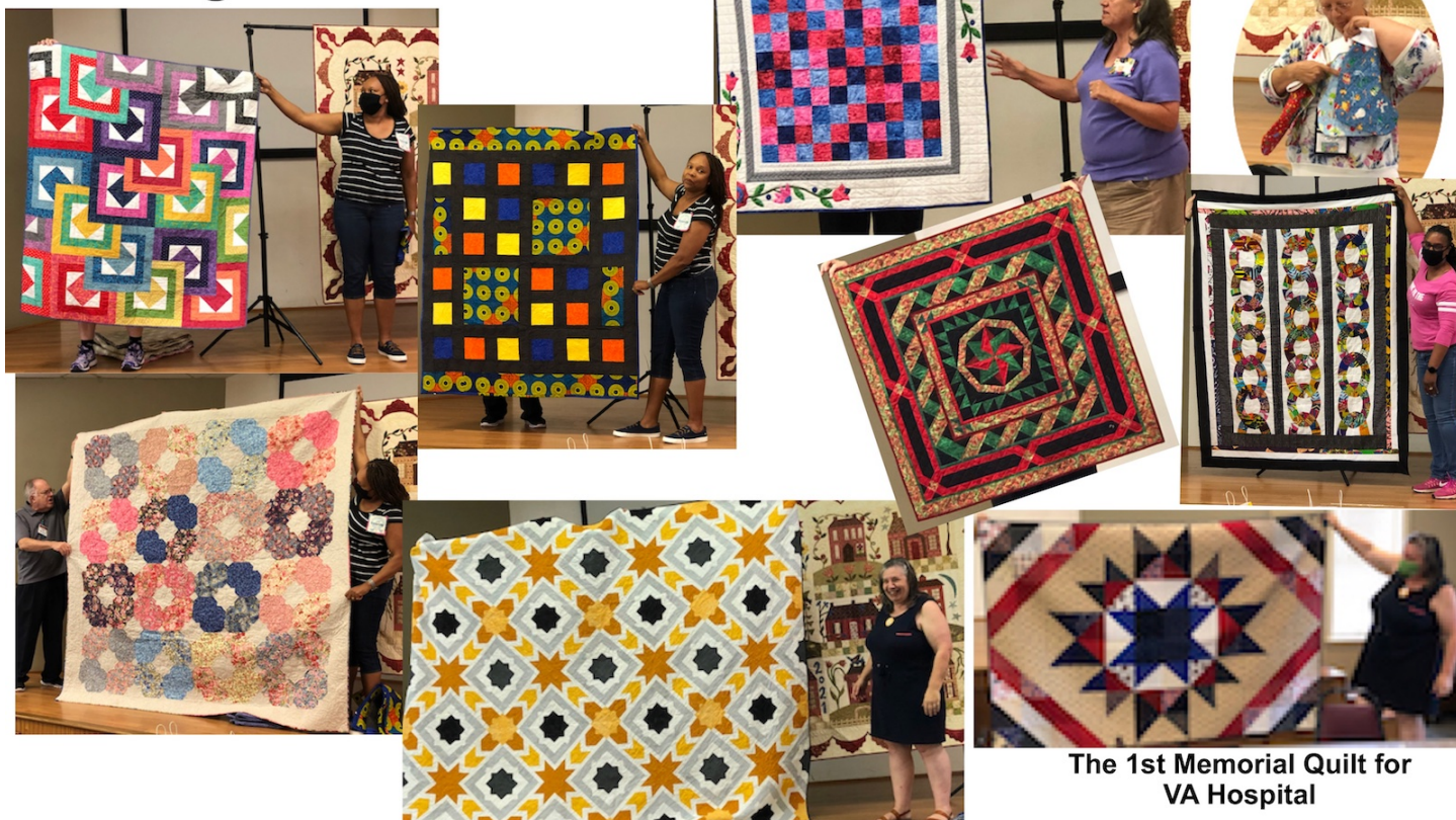
The 1st Memorial Quilt for VA Hospital