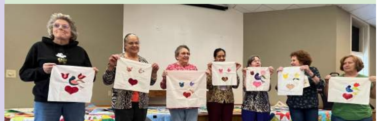
Can't wait to see the finished projects soon!