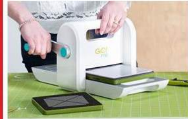
Accuquilt GO!me only $99.99 till Oct 31st.