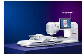
Come see & try the new B 990!

Great selection of Bernina sewing machines, sergers and Longarms on sale! We have the new B990 in stock, no waiting! You'll always get great training and support with your new machine from our shop. Special Hot Buys with this trade-in Sale! Financing available. Delivery & set-up provided with all Longarms.